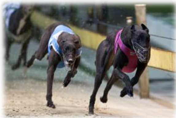
Last Year's winner Bye Bye Bucks

The first winner of the Megastar Dapto invitational in 2010 was Mr Metz and in 2011 it became a Group 3 event and was won by Oaks Road in 29.94. Last year in 2012 the race was elevated to Group 2 status and was won by Bye Bye Bucks in 29.75.